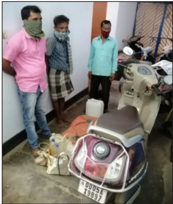
(A.O. Bureau) Khordha, Apr 20: Khordha Excise Squad Conduct Raid

in different places of Khordha, detected four Excise cases and arrested four accused