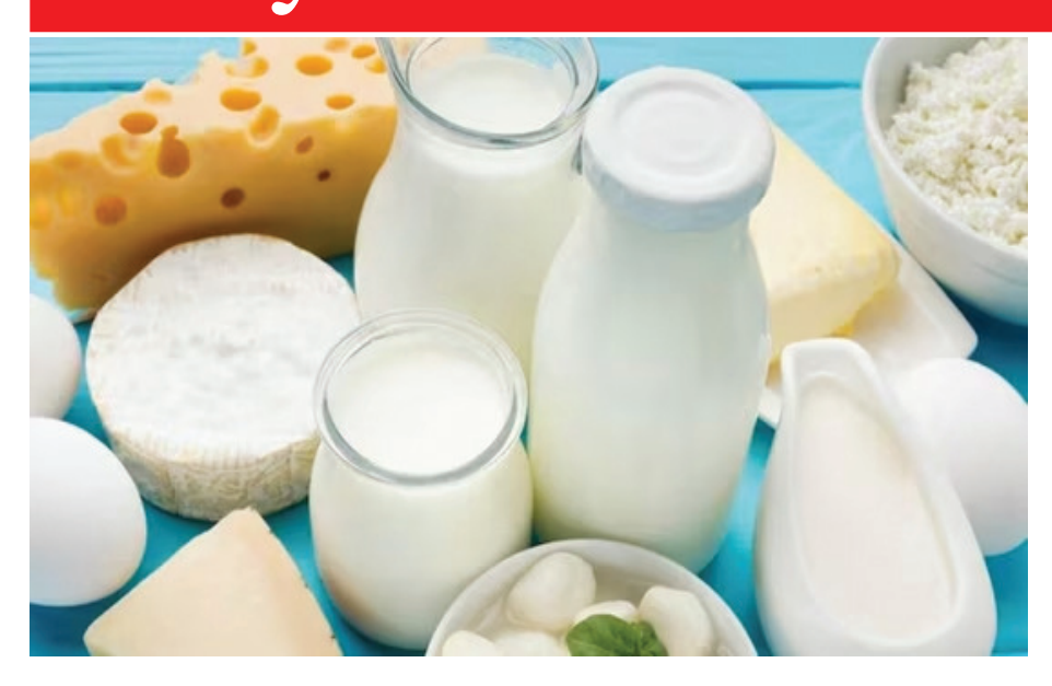
Vitamin B12 or cobalamin is an important nutrient for production of red blood cells, DNA and brain and nerve function. Vitamin B12 binds to the protein in

the foods we eat. It is naturally found in animal foods and vegetarians are at an increased risk of its deficiency. Dairy items like milk and yoghurt, and fortified foods must be consumed by vegetarians for sufficient levels of Vitamin B12. Fish, shellfish, liver, red meat, eggs, poultry, milk, cheese and yoghurt are primary sources of Vitamin B12. The deficiency of this Vitamin B12 can lead to shortness of breath, headaches, indigestion, loss of appetite, palpitations, trouble with vision, memory issues, numbness, weakness, diarrhoea and other neurological issues