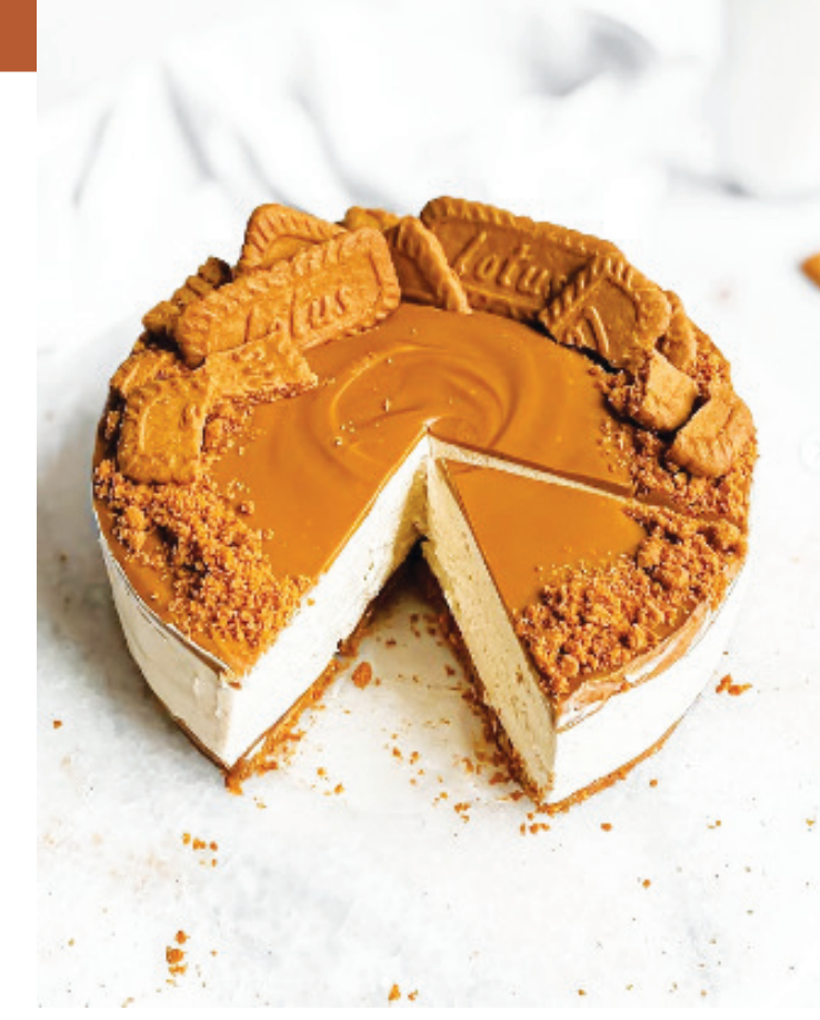
You can serve with the toppings of your choice-from fresh fruits to biscuit crumbs.

Next pour atop the chilled base that was kept aside earlier then again refrigerate for hours or overnight.